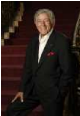
Tony Bennett www.tonybennett.net

Queen City Concert Series Tony Bennett July 7 th , 2009 Flynn Theater, 8pm Tickets on sale @ flynntix.org Tickets - $55 to $95 Limited number of Gold Circle seats and special Taste of Champlain reception $149