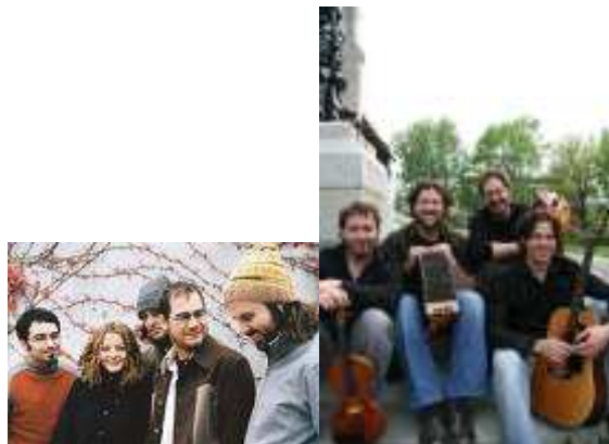
Les Cowboy Fringants / Le Vent du Nord

Quebec All-Stars featuring two of Quebec’s most popular bands. First, the hugely successful Cowboys Fringants (the Dashing Cowboys) blending rock, country, and traditional music. The band is Quebec’s most sought-after music act and has built a large cult following in France—for its virtuoso musicianship and engagement with Quebec history and 21 st century social dynamics.