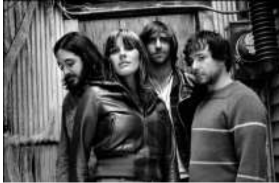
Grace Potter and the Nocturnals

Tickets @ flyntix.org - $30, advanced/$35 day of show